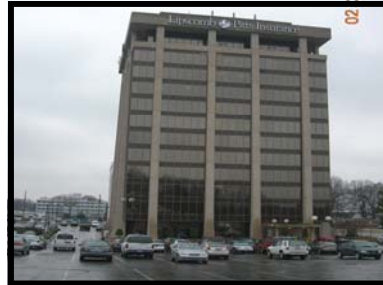
The Lipscomb and Pitts Building Memphis, Tennessee