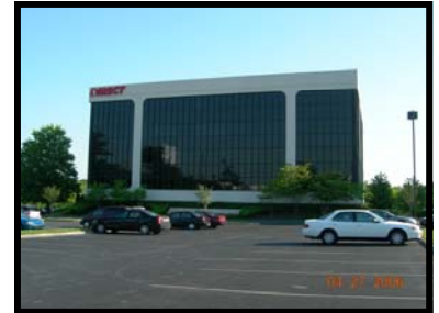
Airways Plaza Nashville, Tennessee