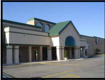
Bainbridge Mall Front Entrance Bainbridge, Georgia