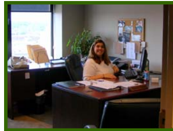
Sunny Spain Property Management,