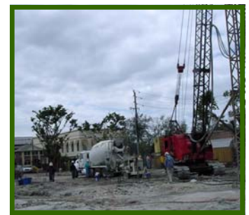
COURTHOUSE PLACE FORT LAUDERDALE, FLORIDA

County Leasing office relocated to a beautiful suite in our Fifth Third Bank Building overlooking the Courthouse Place construction site. This move has given us an onsite marketing presence during construction, while still maintaining a centralized location among the other Broward Assets.